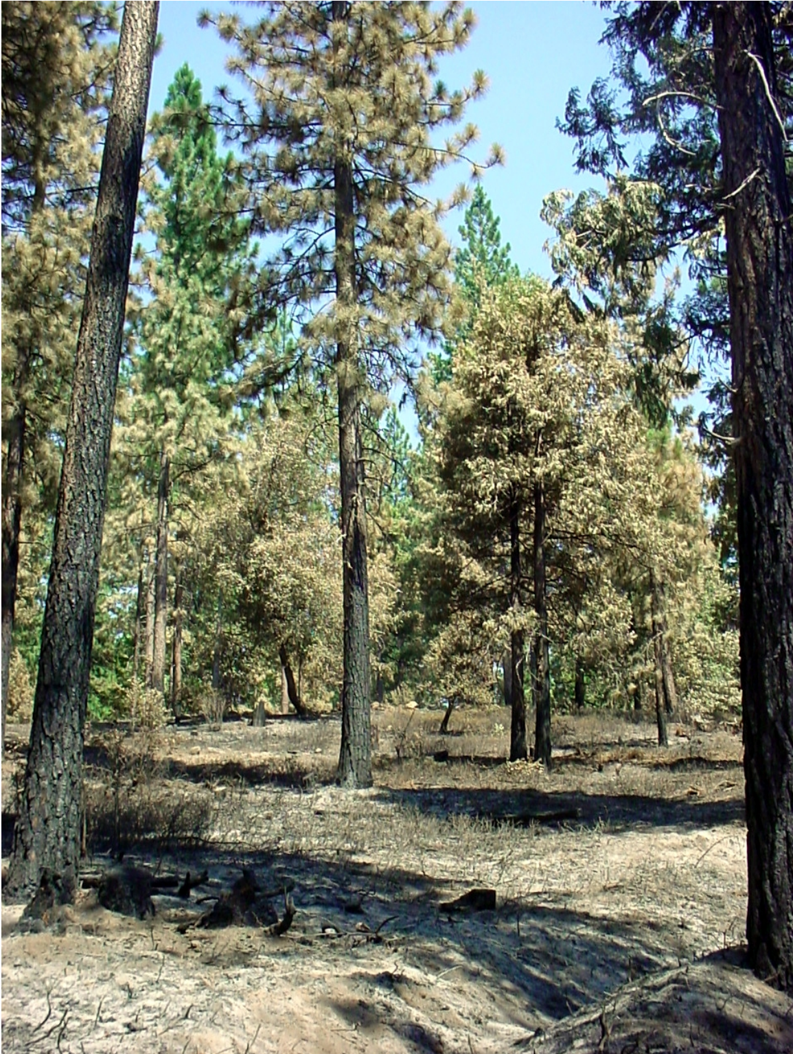
Scorch height in FMZ. No trees torched in FMZ