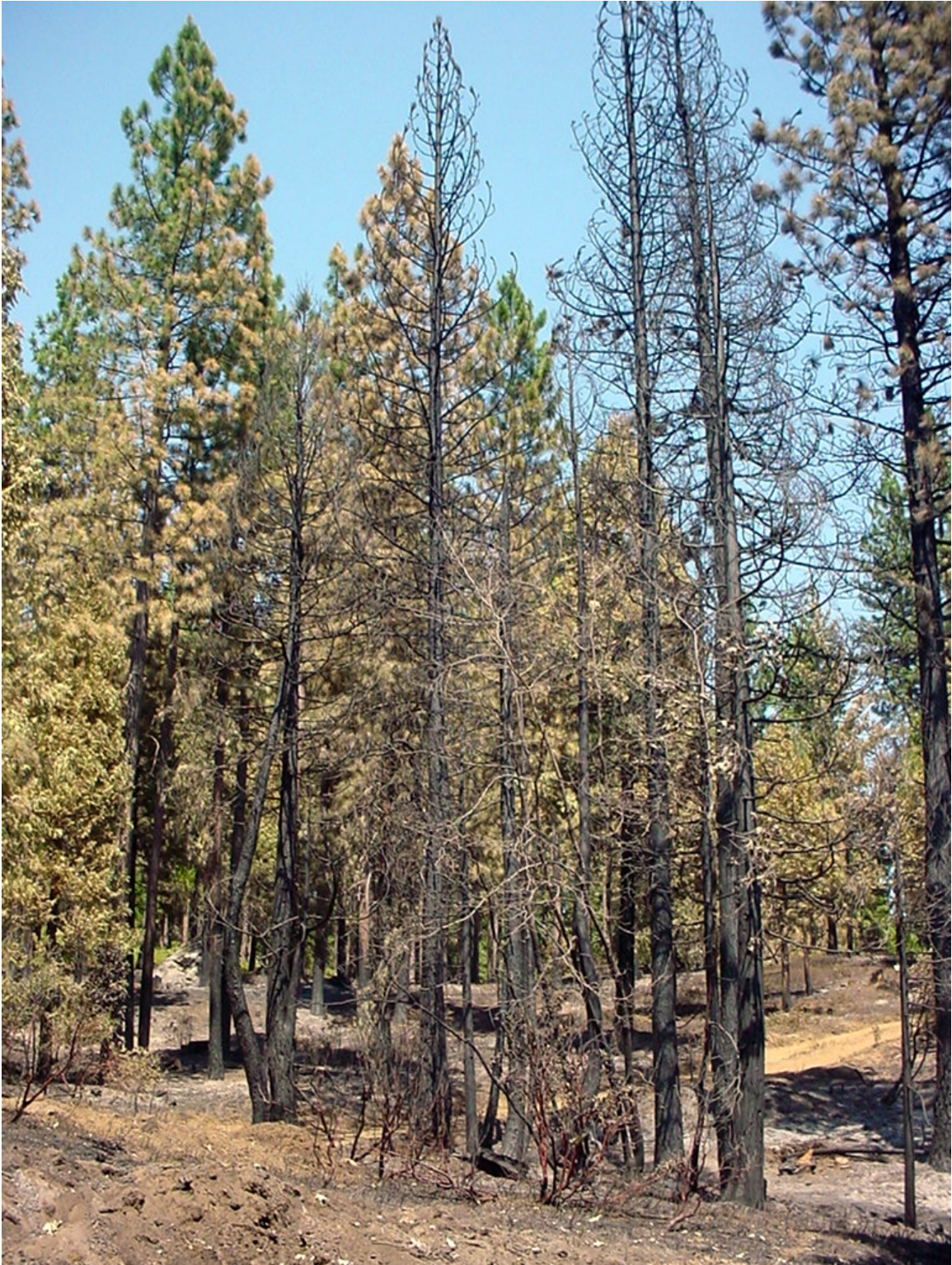
Untreated fuels (torched trees) in foreground. FMZ in background. Divided by visible dirt road.