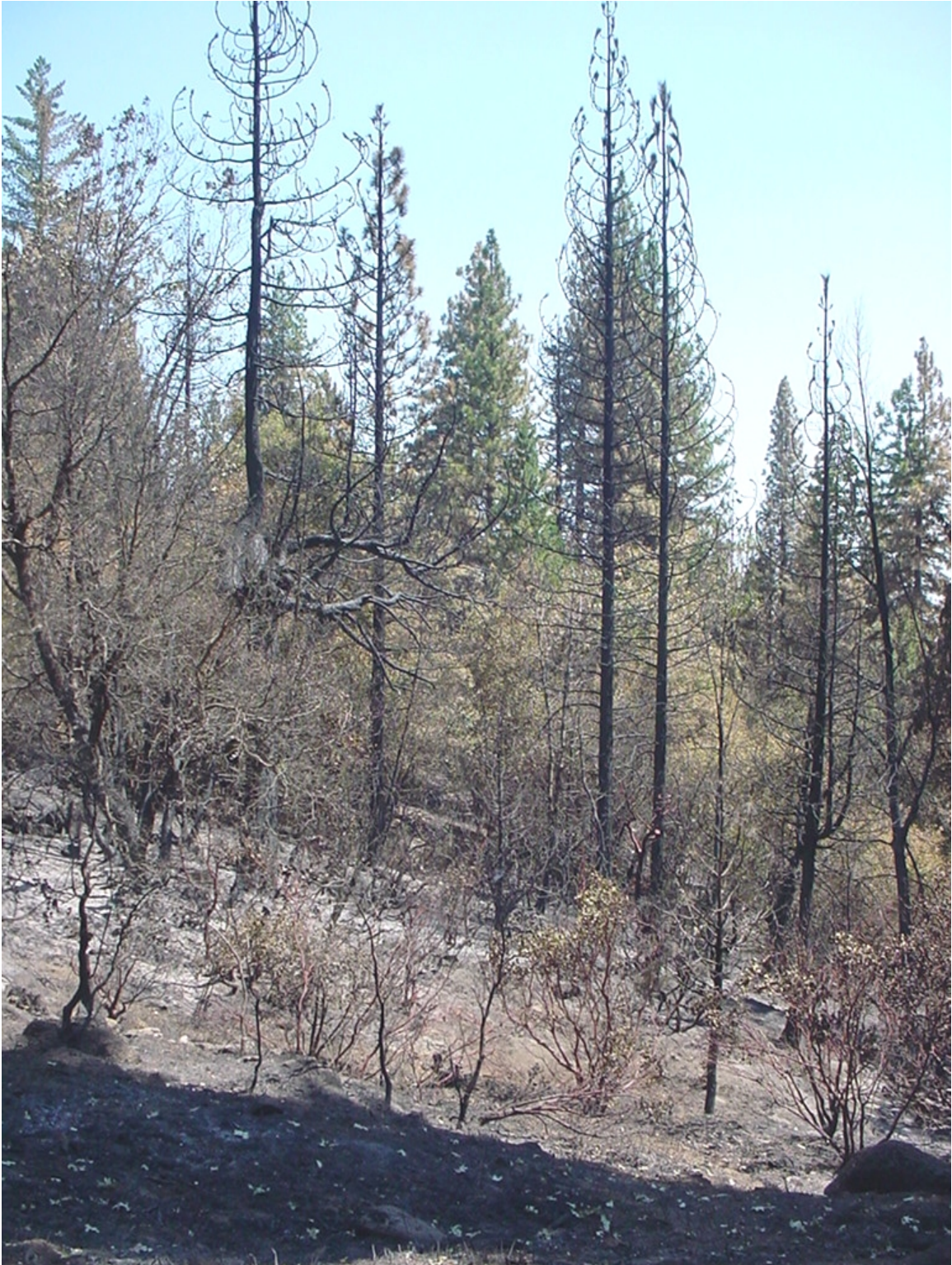
Example of burned ladder fuels in untreated area.