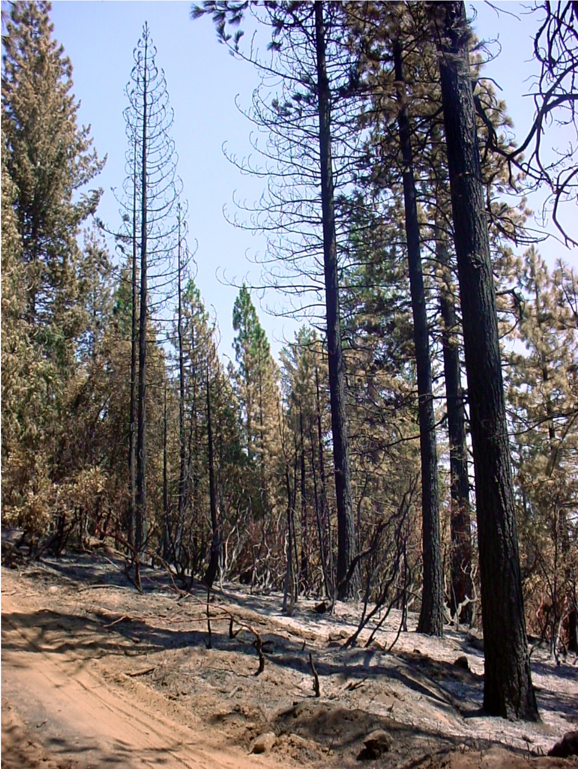
Scorch height in untreated area. Many trees torched in untreated area, a contributing factor to over 20 spot fires at the head of the fire.