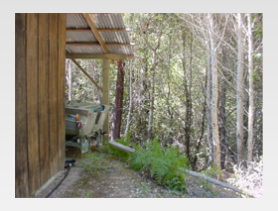
Same residence building after fuel treatment effort.

Through the use of grants and using local volunteer workdays, the FSC has been implementing fuel projects: to create shaded fuel breaks around mid-slope homes in the wildland/urban interface with a high risk of destruction from wildland fire, to provide fire safe protection measures for the homes of senior citizens in the wildland/urban interface, to eliminate ladder fuels and maintain canopy closures above 70% to create low-maintenance shaded fuel breaks (where feasible), and to increase landowner participation and fire readiness through shared responsibility in the project.