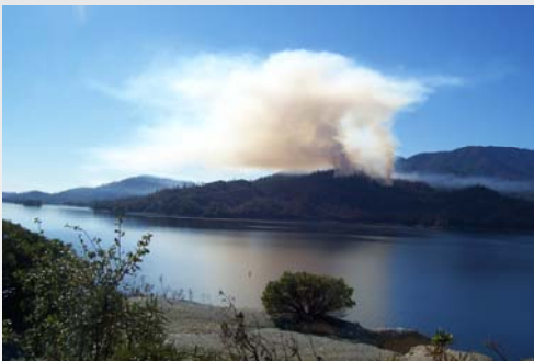
Roost B smoke column rises above Whiskeytown Lake

In early November, a series of small storms moved through the area dropping over seven inches of rain. It seemed the burning window would close for the fall. Then weather conditions dried and warmed with temperatures reaching into the mid 70's. After seven days of warm weather it was determined conditions were favorable to conduct the burn. One hundred personnel participated in the one day burn. Crews worked together to blackline the perimeter of the burn and the helicopter ignited the interior of the unit. Conditions were near perfect as the fire crept along the ground igniting pockets of thick brush and dense thickets of trees. Firefighters patrolled and monitored the unit until significant rainfall occurred on Thanksgiving.